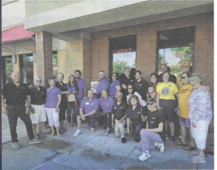
Rotary Club of Olney